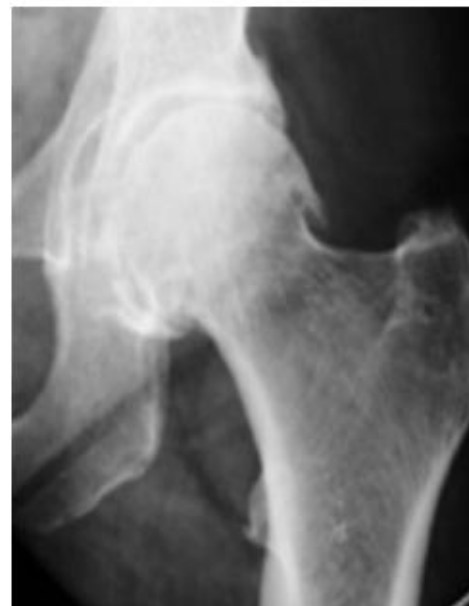
COXARTHROSIS -LEFT HIP

When the medical treatments ( antalgic and anti-inflammatory medications, heel wedges, weight reduction, activity modification, the use of ambulatory aids, intra-articular corticosteroid or viscosupplementation (eg, Synvisc; Genzyme Corp; Cambridge, Massachusetts, and Hyalgan; Sanofi-Synthelabo; New York, NY) injections, physiotherapy have failed, time is coming to implant a prosthesis to relieve pain and to restore hip function.