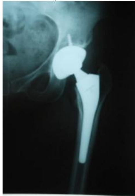
X-Ray of THA

limits the traumatism of the muscles, enables a reduction of intraoperative bleeding and in postoperative pain and allows more rapid rehabilitation.